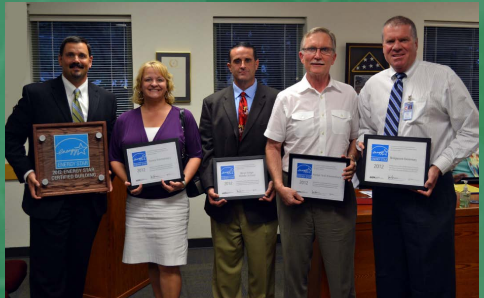
Our 2012 Energy Star awards

2013 applications for those schools scoring above a 75 are pending and once approved the new schools will get an award to place near their front entrance.